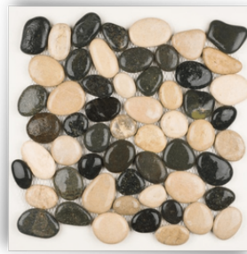
Black & Tan