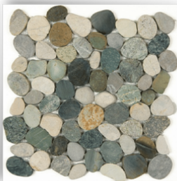
Awan Borneo Mix Sliced