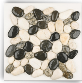
Salt & Pepper