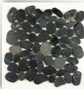
Black Sumatera Sliced