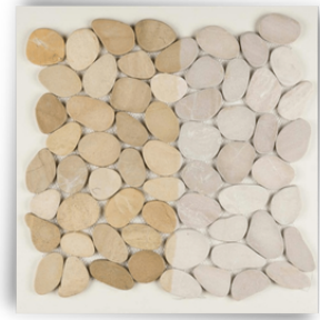
Maluku Tan Sliced