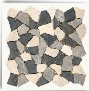
Fresco Mix Flat