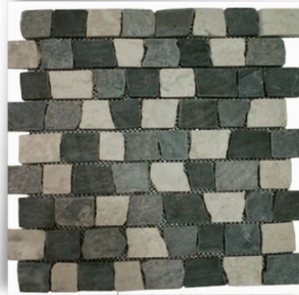
White - Black - Grey