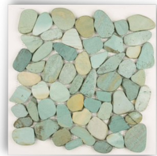
Green Flores Sliced