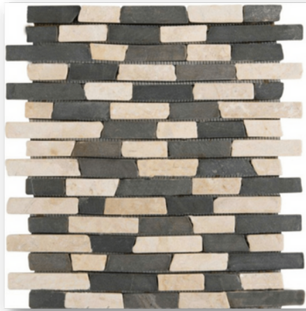
Alur White & Black