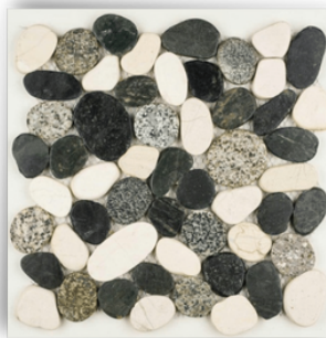
Salt Pepper Sliced