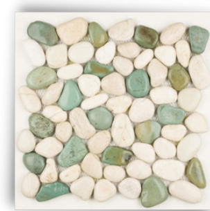
White & Green