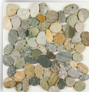
Borneo Mix Sliced