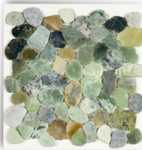
Green Onyx Sliced