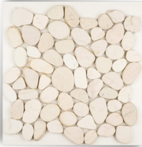
White Timor Sliced