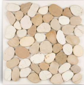
White Tan Sliced