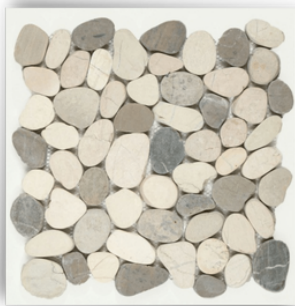
White Awan Sliced