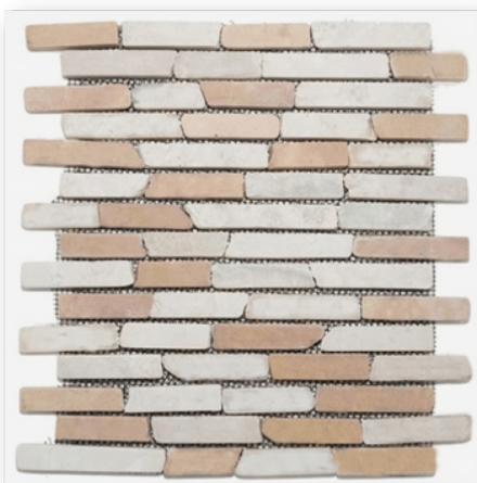
Alur White Brown