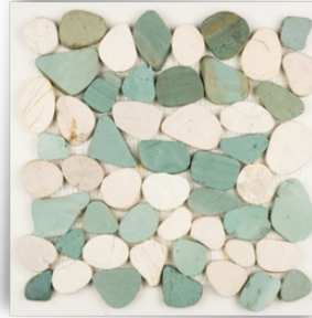
White Green Sliced