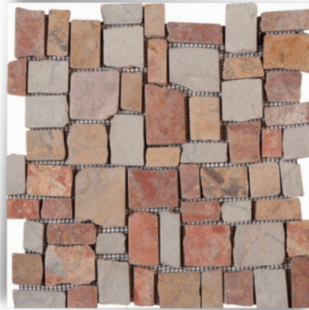
Mix White & Red