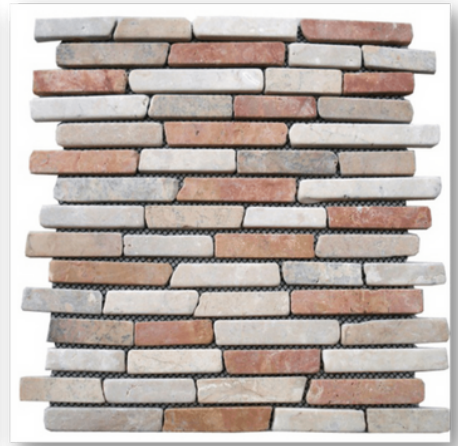
Alur White & Red